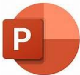
Fig 2. Microsoft Power Point