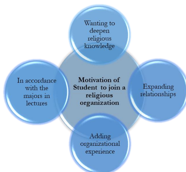
Figure 1. Description of Student Motivation to join a religious organization

Based on Figure 1. The author can explain that after conducting in-depth interviews with informants, there are four motivations for students to join religious organizations. The four themes are i) wanting to deepen religious knowledge, ii) expanding relationships, iii) adding organizational experience, iv) in accordance with the majors in lectures.